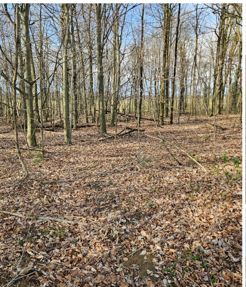
Rare Opportunity! Good, elevated 41 acres, some wooded. Convenient location. Frontage on Warren Rd. and Georgetown St. Sells live only.